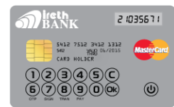
D800™ 13 keys

According to the different combinations of algorithms, protocols, technologies and components available, D800™ Displaycards are issued in many configurations, for a lot of applications and functions, such us: