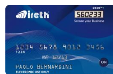
D800™ 1 Key

Each D800™ model can embed payment elements: EMV, EMV Dual Interface, NFC, Dynamic CVV, Dynamic PAN, and others ( All-In-One Displaycards ).